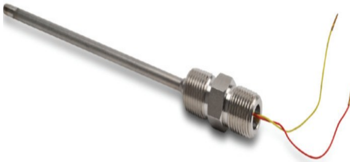
A1MJ & K- HXX L01- 01 & 03